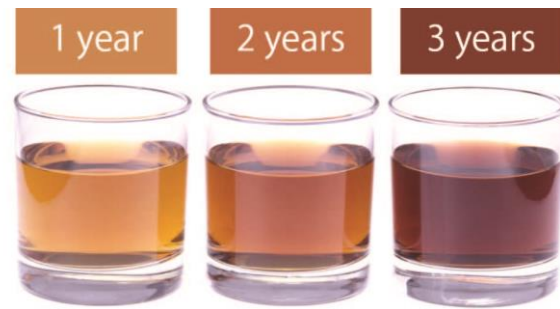
Figure 1. Color change of Kurozu with aging. Left, 1 year old; Middle, 2 years old; Right, over 3 years old.

In Japan, there are many regional brand products that have obtained strong reputations because of their unique production methods and natural characteristics. The Ministry of Agriculture, Forestry and Fisheries (MAFF) of Japan certifies Kurozu as a specific agricultural product.