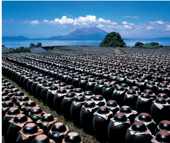
Figure 2. Pottery jars are placed outdoors for the brewing process