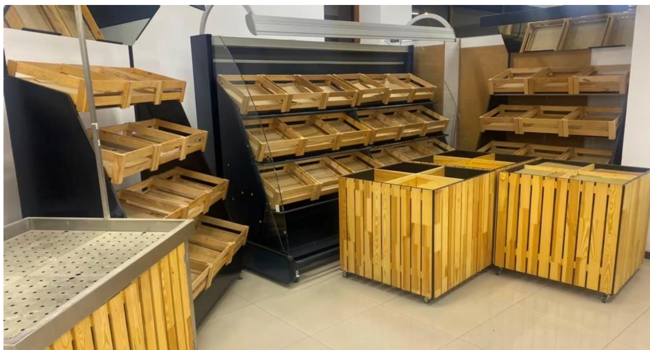
Image 2: Nagorno Karabakh - Empty shelves at a food store in Stepanakert, January 11, 2023. [4]

were significantly more likely to have metabolic syndrome than those in less severe areas or those who were not exposed. Furthermore, age played a role in the disposition to inherit this increased risk, as the fetuses and infants were most affected. Subjects who were exposed to severe famine were much more likely to develop metabolic syndrome as adults than those unexposed [10]. Not only does the existence of famine in infancy increase the risk of developing Type 2 Diabetes, but the increase in famine severity appears to increase the risk of Type 2 Diabetes even further [10].