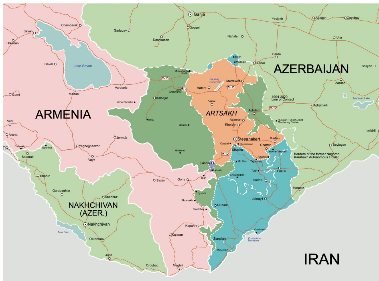
Image 1: Map of the Region, Artsakh (Nagorno-Karabakh) after the Second Karabakh War in November 2020.

security, microbiome, microecology, choratan, matsun, narine, immune system, selenium, iron, phytonutrients, cultural appropriate, food aid, refugees, bioactive compounds, fermented food, Azerbaijan, blockade of Artsakh, and genocide.