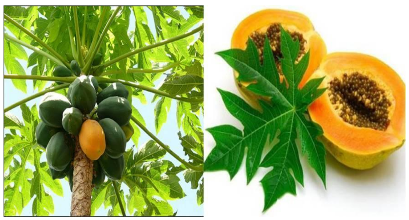
Figure 1. C. papaya plant and fruit with seed